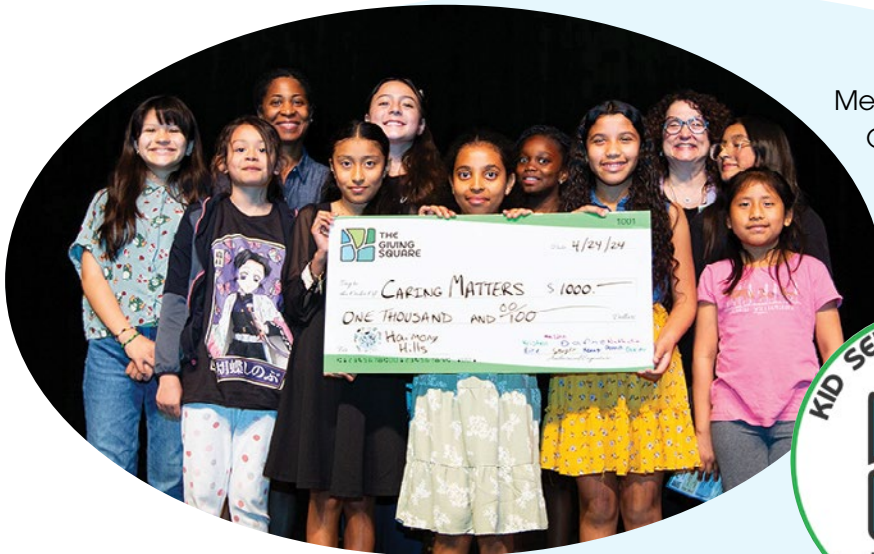
Members of the Giving Square's Kids to Kids Fund presented the grant to CaringMatters.