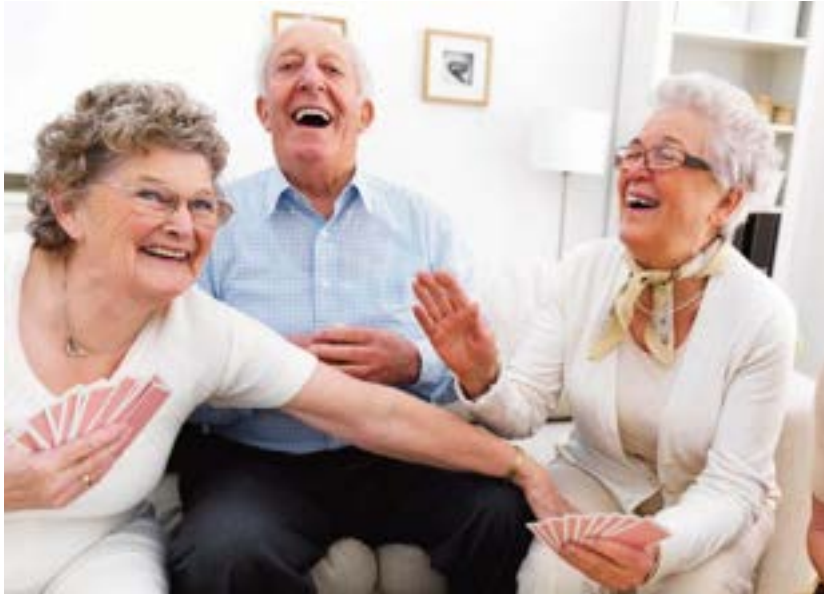
Develop and nurture friendships People who make an effort to stay connected to people in their community often find that when problems develop, they have friends available to help.

Visit www.LongTermCare.gov for a customized tool to help you understand what long-term care services you can expect to need, how much you can expect to pay for them, and what financing options are available.